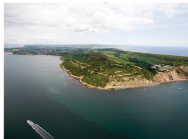
Left and above: The lighthouse was added to the Needles lighthouse in 1867. As well as steering ships passing up Channel, the light warns vessels of the narrow entrance past Alum Bay (seen right above) leading to The Brans, towards which the boat vessel in the photograph is heading.