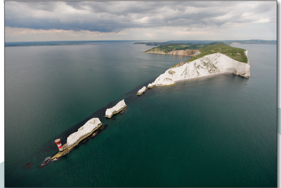
Spectacular views of The Needles and the Needles lighthouse.