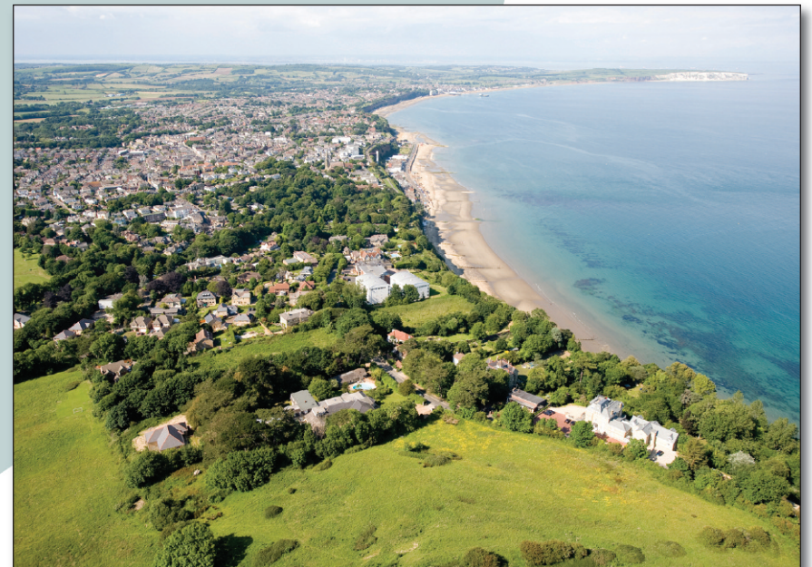
View over Shanklin looking towards Sandown and Foreland point.