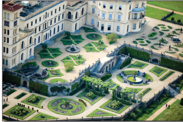
Osborne House was built c. 1850 as Queen Victoria's and Prince Albert's summer residence in East Cowes.