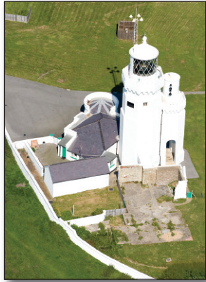
A close up view of St Catherine's lighthouse.