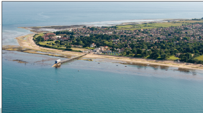
Right: The lifeboat station and slipway, Bembridge.